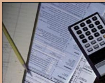
Eyethu Community Finance Centre provides banking services to thousands of disadvantaged entrepreneurs in the rural areas of Mount Frere, Alfred Nzo and O.R. Tambo Districts.

The grant will be used to open a new office in Bizana which will improve delivery of loans in targeted areas around the region; research the demand for and design educational and housing loans; develop a training strategy and provide training in the areas of customer relations, business management, lending methodology, risk management and organisational development; and mentor and support aftercare of clients by providing training and ad hoc business development support.