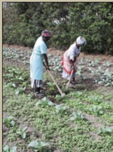
Mhlontlo Local Municipality is one of the most rural in the Eastern Cape and thousands of people depend on small-scale subsistence farming as a key component of their livelihoods strategy. The LED strategy funded by Thina Sinako will look at how to improve opportunities for women like these.

The Transkei Land Service Organisation (TRALSO) will support the development of an LED strategy for the Mhlontlo Local Municipality over a period of four months. The project is supported by funding from Thina Sinako and the municipality, and it will result in a plan for the stimulation of economic growth within the municipality.