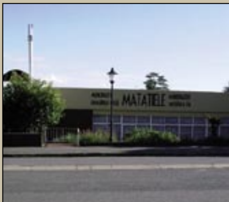
Matatiele Local Municipality will plan for a regional conference and training lodge with municipal offices with the funds granted by Thina Sinako.

The strategy process will incorporate the needs and constraints of all identified stakeholders, as well as local infrastructure requirements, tourism concerns and ambitions, additional service and facility options (i.e. fuel station, restaurant, travel agency office options, etc.). A comprehensive business plan will be developed for the most viable implementation model.