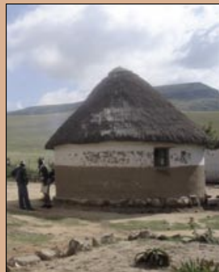
Matatiele Financial Services will bring its banking, microfinance and insurance services to rural villages in the Alfred Nzo District Municipality.

Alfred Nzo is the poorest and most rural municipality in the Eastern Cape. Aspiring entrepreneurs cannot access finance from the formal financial institutions because they cannot raise the collateral needed by the bank and there are no banks in villages. Matatiele Financial Services (MFS) is a development micro finance organisation that issues micro loans to the poor and marginalized rural communities, especially to businesses owned by women in village centres. Both start-up and existing businesses in the Eastern Cape and KwaZulu-Natal are supported, using limited resources.