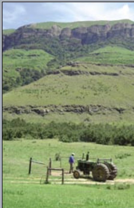
Agriculture is a key industry in LED in the Ukhahlamba District Municipality.

Thina Sinako is funding a Baseline Economic Assessment for the Ukhahlamba District Municipality. The project will collect and interpret data on LED funded initiatives in the area. It will include an assessment of all poverty alleviation and LED projects. Possible business opportunities, entrepreneurs and innovative enterprises will be identified. The information will be presented in an accessible format linked to the current GIS system to show, by ward, the type, size and grading of all initiatives and project needs. This information will support the municipality in making informed decisions, directing funds, developing skills and networks, and enabling cooperative development with the municipality's IDP processes. It will also be used as a networking tool for clustered projects to enable better marketing and increase competitive advantage.