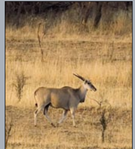
The Blue Crane Route Municipality will, amongst others, support the game farming industry to develop ecotourism products that will provide jobs and develop the local economy.

The Blue Crane Route Local Municipality (BCRM) includes Somerset East, Cookhouse, Pearston and surrounding farms in the Western Region of the Eastern Cape. The Thina Sinako Local Government Support Fund grant will enable the municipality to develop a Strategic Plan for Local Economic Development that will become part of the Integrated Development Plan. This will allow for a more effective linkage of the LED work of the municipality and the Blue Crane Development Agency. In addition, the project will explore and document the economic relations between the five Karoo municipalities of Ikwezi, Baviaans, Camdeboo, Sunday's River Valley and Blue Crane Route.