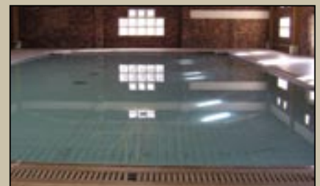
The Cradock Spa is the focus of a project being undertaken by the Inxuba Yethemba Municipality to make it an economic asset for the district.

The project will review existing feasibility studies (including proposals, plans to upgrade, applications to purchase, etc.) and update them to inform a collective identification of the competitive advantage of the Spa. All of this information will be used to develop a business plan, accompanied by a resource mobilisation strategy. The identification of private sector role-players (both established and emerging) to partner the IYM in the profitable running of the Spa is a key component of the plan. The Council supports the establishment of mutually beneficial partnerships to maximise the value and sustainability of the Spa as a municipal and public asset.