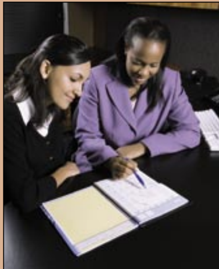
Women are the primary clients of Tlholo Entrepreneur Support Centre. They assist young women to access microfinance to start up their own businesses.

Most developing entrepreneurs access financial services through formal banking institutions that provide only savings and banking services located in small towns. Development finance institutions operating in Ukhahlamba concentrate mainly on agricultural development finance and do not operate in the micro enterprise finance sector. Tlholo Entrepreneur Support Centre is the only institution that provides micro enterprise finance and ad hoc business development services to the rural communities in the district. It focuses on group lending to micro entrepreneurs. Tlholo serves the district within a 200 km radius from its base office in Lady Grey. Its current client base consists of 95 % female borrowers, mainly in the youth segment of the population.