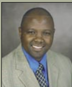
Hon. M Sogoni MEC: Economic Development and Environmental Affairs Eastern Cape Provincial Government.

The Provincial Treasury and the other provincial partners in this Programme are supported by a Programme Coordination Unit, twelve (12) members of which sit in Regional Offices in each of the six (6) district municipal areas in the Province. These Regional Offices not only provide project generation and implementation support on the ground, they also support the development of integrated LED support networks at district level.